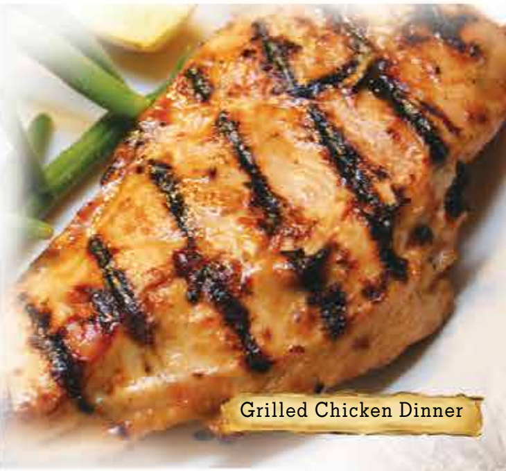
Grilled Chicken Dinner

GRILLED CHICKEN DINNER Two tender and juicy chicken breast fillets seasoned and grilled over an open flame. Served with choice of two sides 13.99 BBQ 14.99 Cajun 14.99