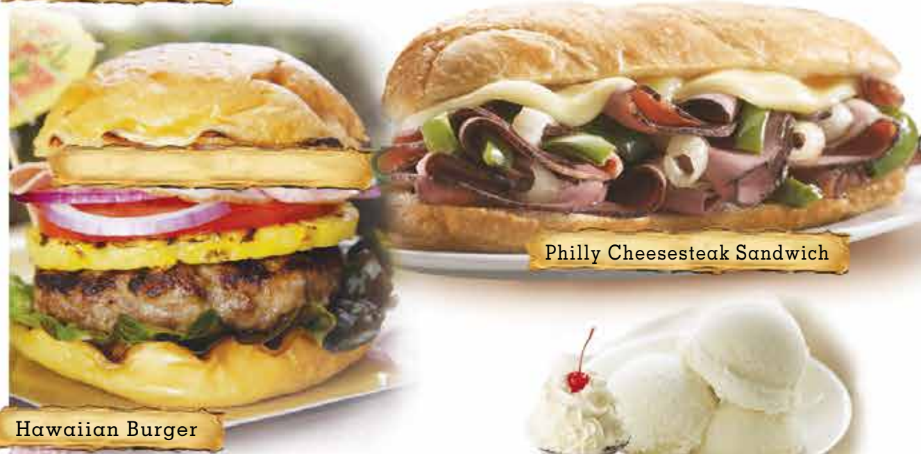
Philly Cheesesteak Sandwich