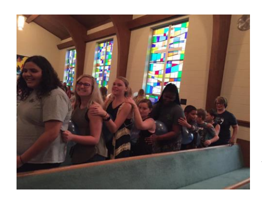
Left: Worship at Columbia UMC