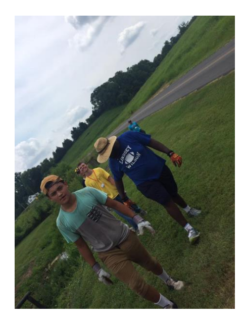
Right: Cleaning up the farm of an elderly resident

Church and Community Partners: We love our partners!!! A big thank you to all the local organizations that have come on board in powerful ways to support the ministry happening at the CRC!