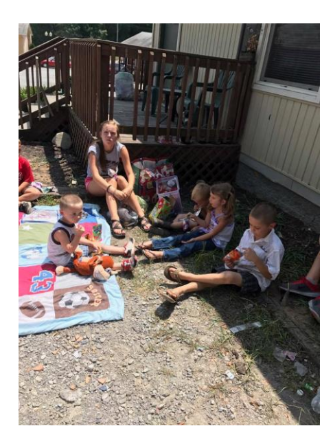
Left: Backyard Vacation Bible School in public housing neighborhood